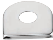
Brass Wall Flange Cute Cat No. JSF-1002