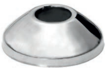
Deep Katori Flange Cat No. JSF-1007