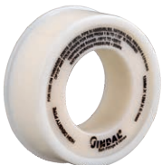
Taflo Tape 12 Mtr. Cat No. JTT-1001