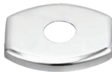
CP Brass Flange Touch Cat No. JSF-1008