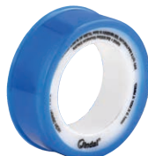
Taflo Tape 10 Mtr. Cat No. JTT-1002