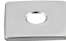
Square Flange For Concealed Stop Cock Cat No. JSF-1006