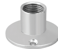
CP Display Flange Cat No. JSF-1009